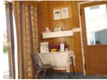
ABOVE: Photos of Ruru Women's and Men's Hockey teams and apparel. FAR RIGHT: Panui area in the foyer.