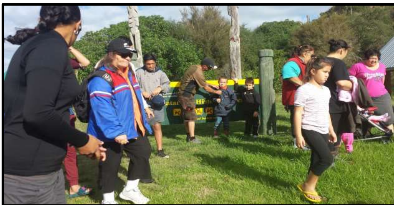
Pictured above: Nga uri o Ngāti Hinepare, Ngāti Mahu, Ngai Tāwhao gathered at the waharoa of Ōtatara Pa.

Seizing the moment was a first for the majority of us, to walk and climb atop Ōtatara and Hikurangi Pa, Tuhirangi Maunga and Mātaotao papa kainga.