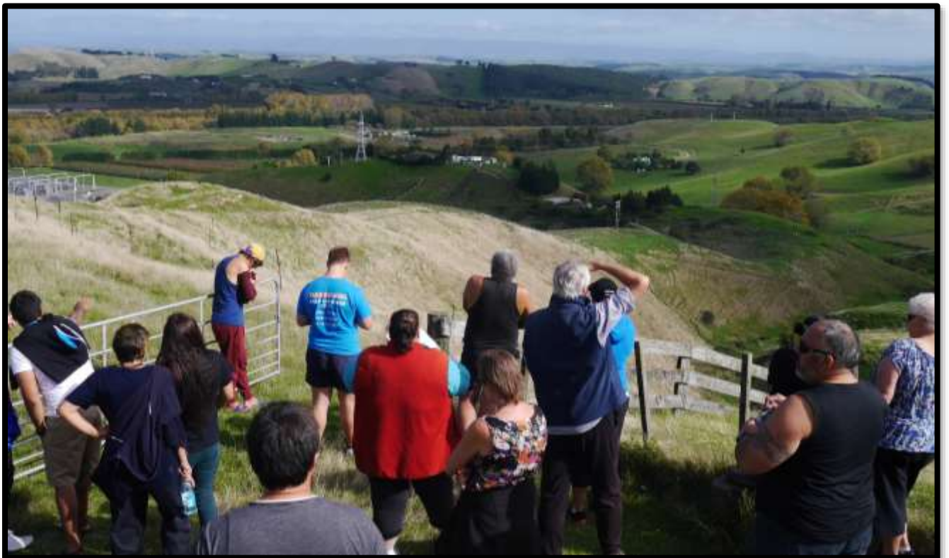
Pictured above: A view from Hikurangi looking west towards other Pa located along the river banks of the Tūtaekurī awa. In the distance “pointing to the heavens,” is Tuhirangi te maunga.